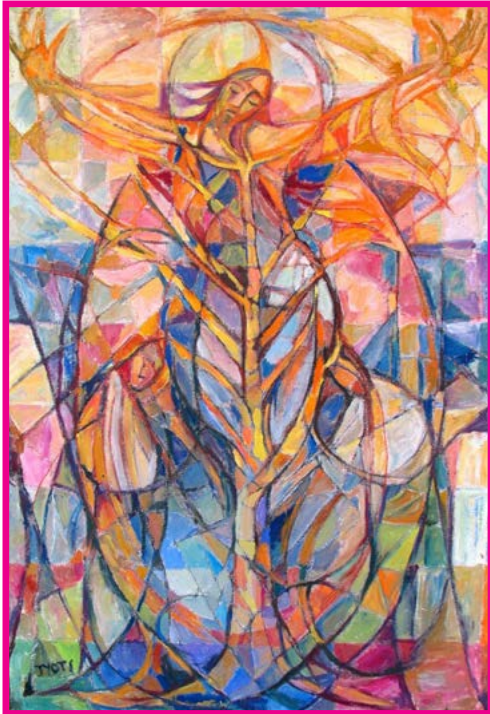
Jyoti Sahi (b. 1944), Resurrection , 2007. Oil on canvas.