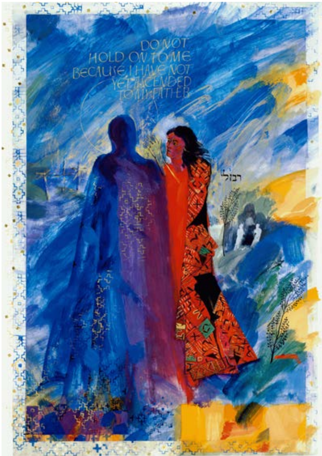
Donald Jackson (b. 1938), The Resurrection , 2002