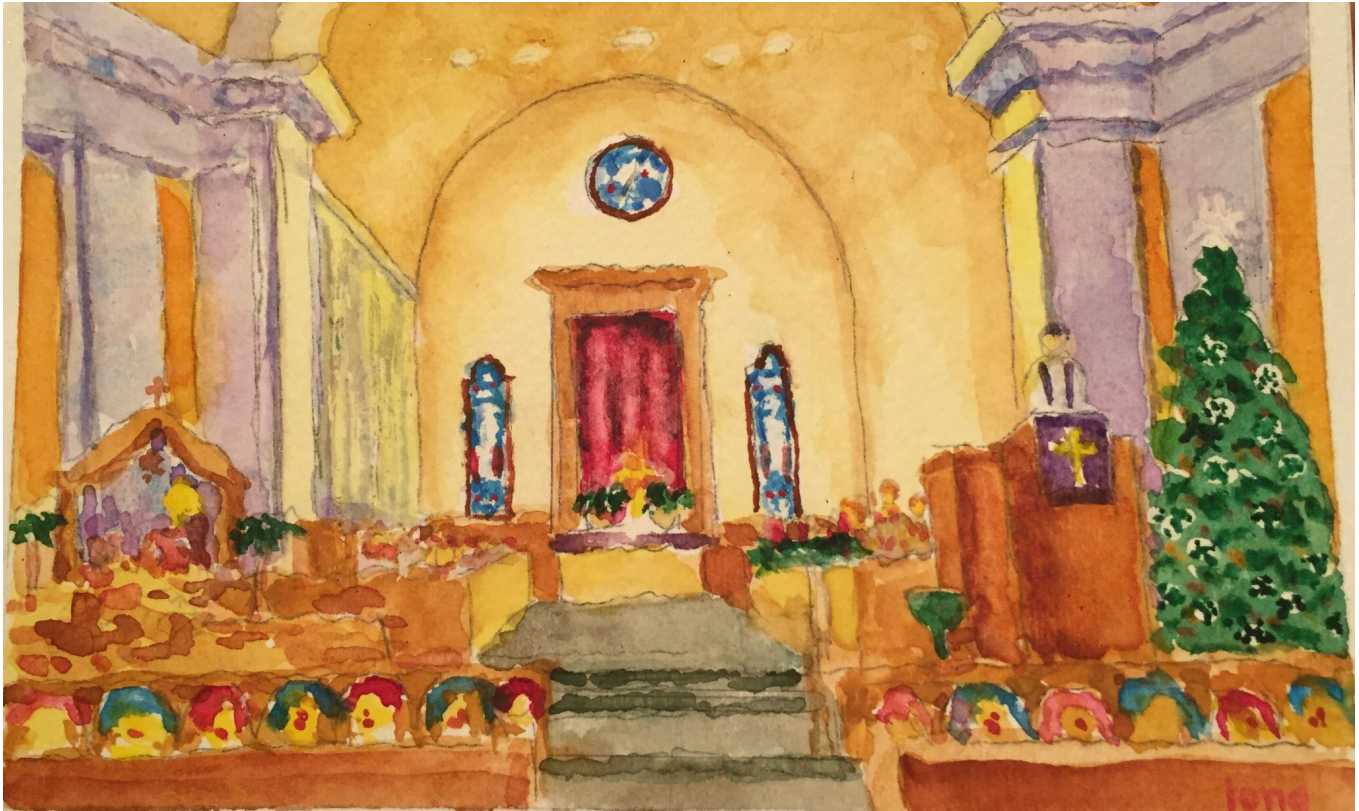
Artwork by Richard Long