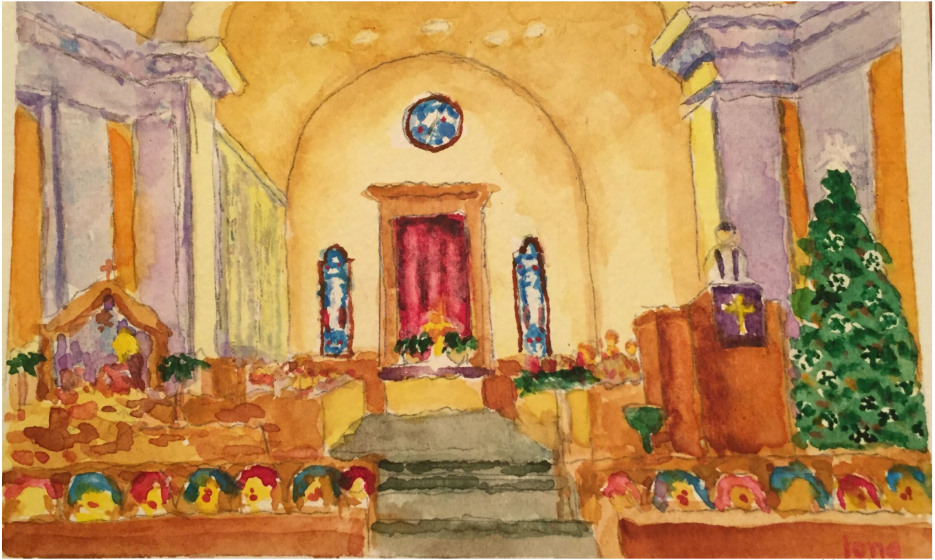
Artwork by Richard Long