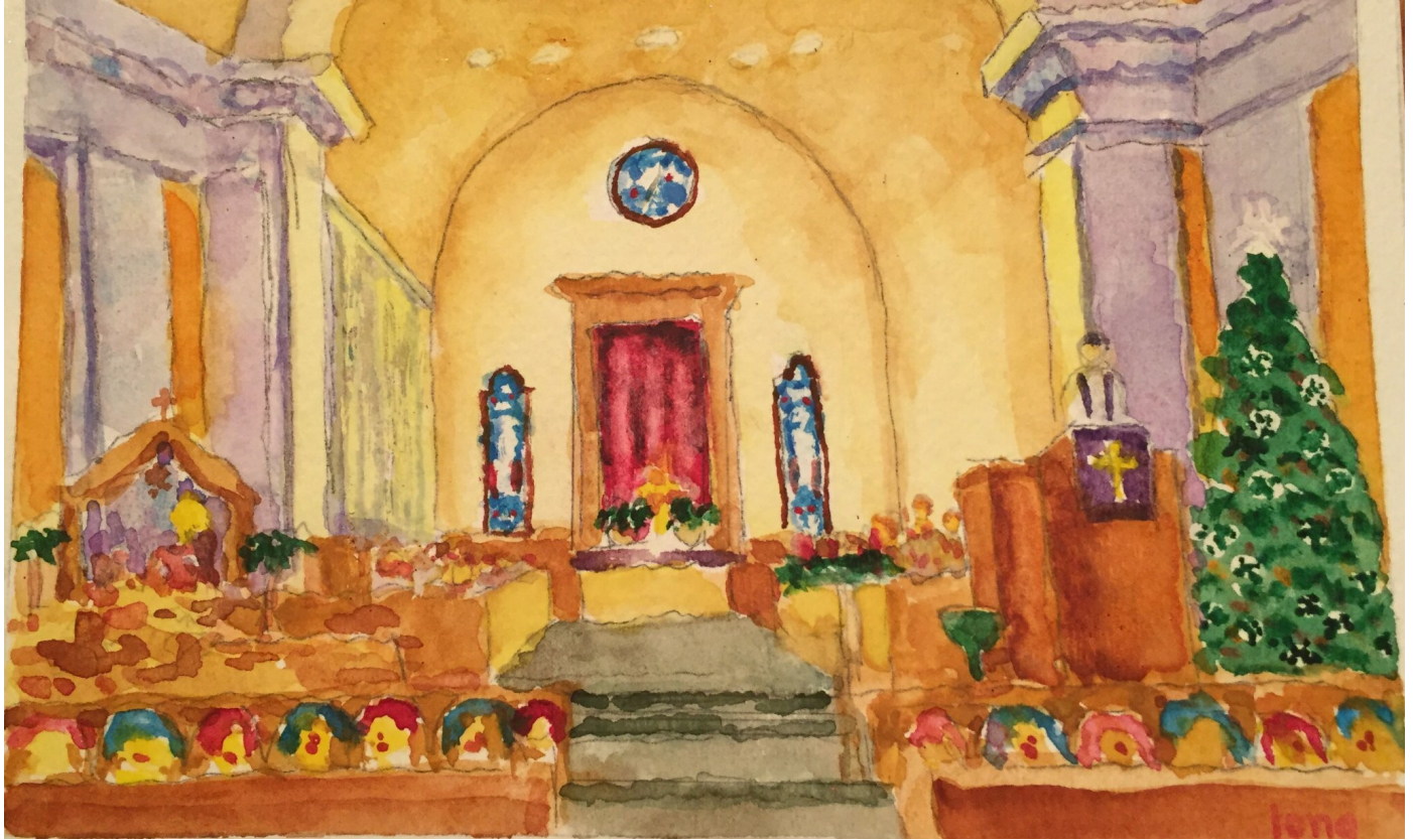
Artwork by Richard Long