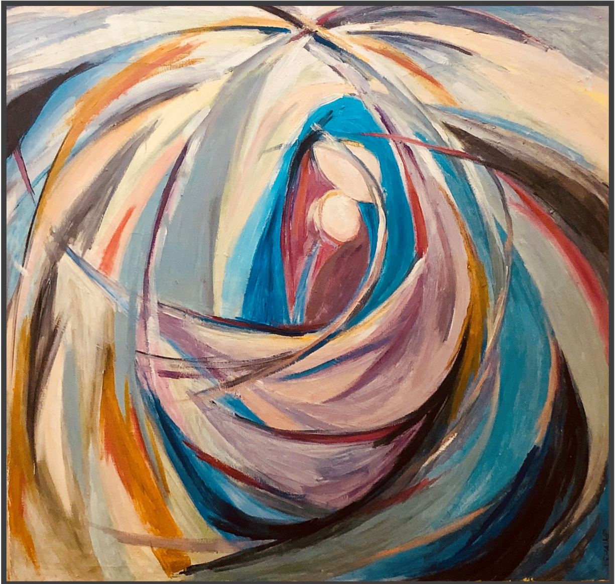
Artist: Dorothea Spain