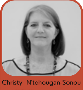
Bahá'í Faith August 13