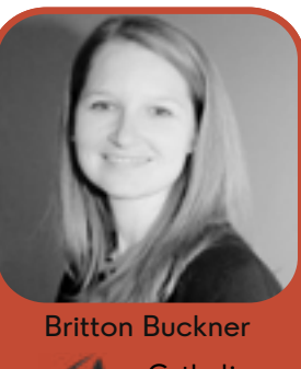
Catholic Relief Services June 11