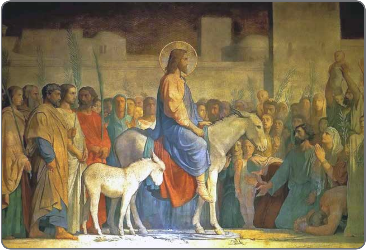
Christ's Entry into Jerusalem, by Hippolyte Flandrin c. 1842

Our service begins with a procession of the palms to recall the triumphal entry of Jesus into Jerusalem. The palms we wave reflect the fragility of the celebration since a mere five days later the crowd's adulation turns to hatred. In Philippians, we read Paul's account of Jesus' ministry. Paul sums up the humiliation and the glory of Jesus that we prepare to honor this week. The gospel narrative is a retelling of the passion of Christ, drawing from the gospel of Mark.